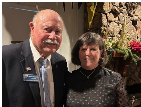
SDAYC Outgoing Commodore & Vice Commodore